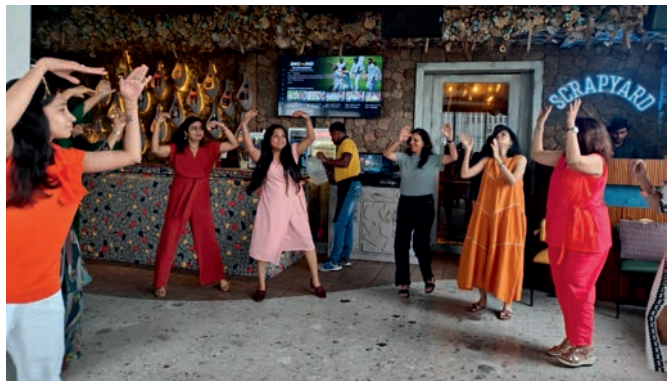
A sundowner Ladies sindhara party held on the 16th July at the "Glass House Scrapyard". It was a fun-filled evening attended by around 30 members of the club . The atmosphere was lively with great music, energetic dancing, and fun games. A charismatic emcee kept the energy high, keeping everyone on their toes . The event filled was thoroughly enjoyed by all and the sumptuous food was the cherry on the cake.