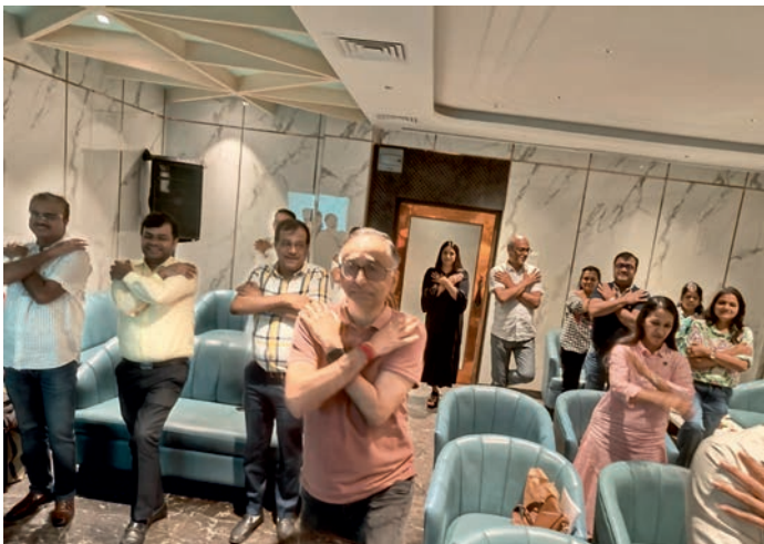
World yoga day was celebrated at RWM