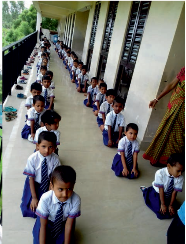
World yoga day was celebrated at RVPS on 21st June